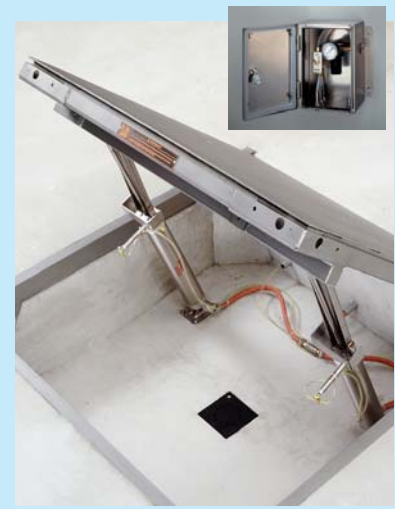
Pneumatic control and cylinders automatically lift the EZ-CLEAN scale for cleaning.