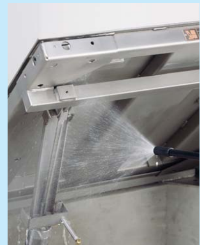
The EZ-CLEAN scale tilts up 45 degrees to expose the underside and pit for washdown.