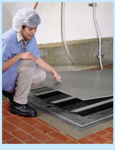
The EZ-LIFT scale has gas-pressurized struts that make it easy to lift the platform for cleaning.