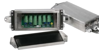
IP69K junction box for extra protection.

Optional stop bars help position loads on the platform.