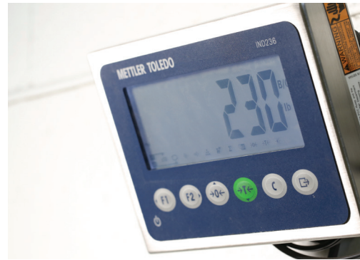
The user-friendly terminal features large display, various mounting and communication options.